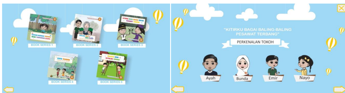
Picture 2. The traditional game story e-book series app picture design

The pictures in this story book were arranged and illustrated simple so it will be easy to be understood by children. The color use fits the children's reading and it is followed by the story narration. The picture design explains in 2 pictures below: