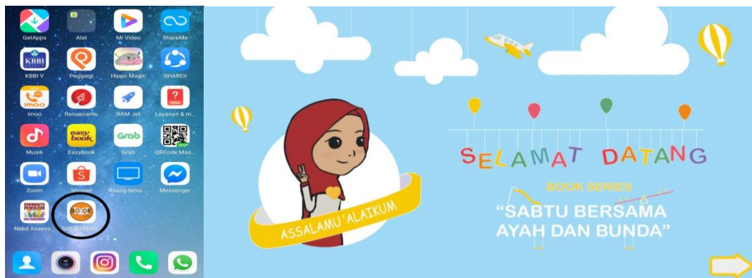
Picture 1. Traditional Game Story E-book App

interaction of each family member playing traditional game such as teamwork to find out the game material, how to make it and how to use the game tools, also the gratitude reflection of the accomplishment of each planned task.