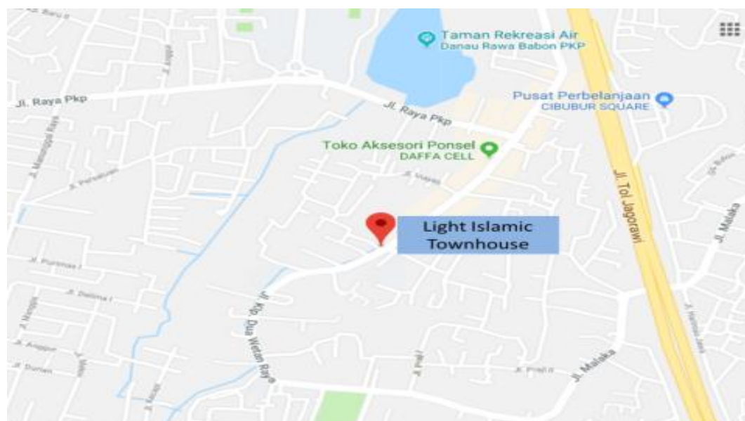
Figure 1. Map of the townhouse

The focus of this study was a four-week interview and observation at Light Islamic Townhouse. This Townhouse is located in the area of Rukun Tetangga (RT) 04 Rukun Wilayah 08, Kelurahan Kelapa Dua Wetan, Ciracas Sub District, East Jakarta. Based on Blakely and Snyder (1997), the town house tends to a security zone communities. The RT 04 area has three types of settlements, namely: two townhouses for upper class residents, housing for middle class residents and kampung for lower class residents.