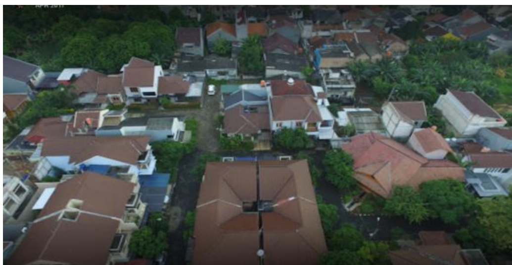
Figure 2. Perspective view of LIT

Activities carried out by residents of LIT are religious activities specifically for residents of LIT. The religious activities are in the form of l'tikaf , bi-weekly studies, hospitality ( silaturahmi ), and family gatherings.