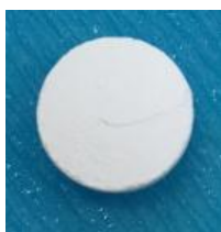
Figure 1. The orodispersible tablet of atenolol with croscarmellose sodium as superdisintegrant

The atenolol contents in control formula, formula 1, and formula 2 met the thresholds set by the Farmakope Indonesia, namely 90%-110% (Depkes RI, 2014). The orodispersible tablets of atenolol must have sufficient physical strength to withstand various mechanical shocks during the manufacturing, packaging, and delivery processes. The orodispersible tablets of atenolol produced in this research had an excellent hardness between the range of 2-4 kg (Deshmukh et al. , 2012; Sharma, 2013). The three formulas met the standards for ODT hardness.