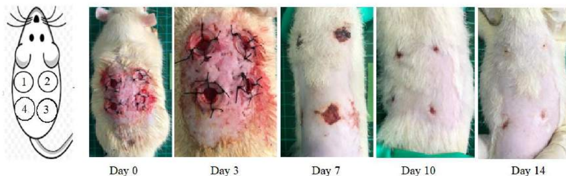
Figure 1. Rat wounds created with punch biopsy

Wounds were created on day 7 after hyperglycemia induction. Experimental animals were anesthetized by injection of 0.2-0.3 mL of ketamine intramuscularly. The rat hair on the back was shaved off. Subsequently, 4 wounds with a diameter of 8 mm were created on the shaved back using a sterile punch biopsy (Figure 1).