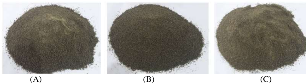
Figure 1. Moringa Leaves effervescent granules of (A) formula 1; (B) formula 2; (C) formula 3

Measurement of bulk density aims to determine the material bulk. This parameter described the volume that will be occupied by a certain number of granules, hence have an impact on determining dosage pack and the process of filling into the primary package (Van den Ban dan Goodwin, 2017). Furthermore, determination of compressibility index and Hausner ratio were used to indirectly ascertain the flow characteristics. The compressibility index measured the bond strength between particles and bond stability, while the Hausner ratio measured inter particulate friction (Khandelwal and Shah, 2016). Lower values of the compressibility index and Hausner's ratio indicated better granule flow characteristics than those with higher values of both parameters (Saw et al., 2015). Based on the compressibility index and Hausner ratio, it was discovered that the granules of formula 1 were included in the good flow characteristics. Meanwhile, formulas 2 and 3 showed very good flow characteristics (compressibility index 10% and Hausner ratio in the range of 1.00-1.11). The difference in the ratio of citric acid to sodium bicarbonate affected the flow characteristics in terms of compressibility index value and Hausner ratio. Therefore, increasing the proportion of citric acid in the effervescent agent increased the flow characteristics (Grajang and Wahyuningsih, 2019). This is because citric acid has high specific gravity and good flow characteristics (Sun et al., 2020).