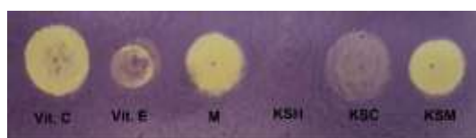
Figure 1. Chromatogram of qualitative antioxidant test for methanol extract (M), n -hexane fraction (KSH), chloroform fraction (KSC), methanol fraction (KSM), and vitamin C and E (positive controls) with concentration 1 mg/ml each using TLC-based technique and DPPH