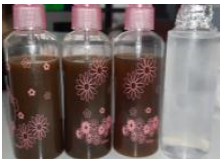
Figure 1. Aloe vera extract spray formulation results