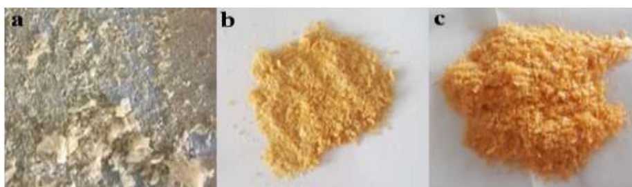
Figure 1. Foam-mat drying products before sucrose addition: lime (a), lime-tomato (b), lime-carrot (c)

The final products of the foam-mat drying, which are functional beverages formulated from lime, tomato, and carrot can be seen in Figures 1 and 2. The dry yields of lime, lime-tomato, and lime-carrot processing were 11.31±2.72%, 7.76±1.33%, and 11.34±2.83%, respectively. In this study, the addition of carrot did not change the yield, but when added with tomato, the yield of lime functional powder drinks was actually reduced.