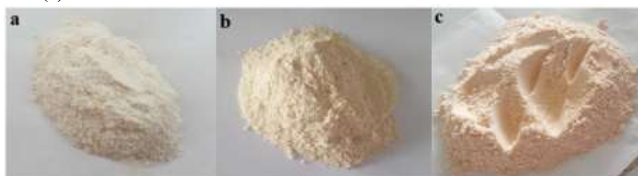
Figure 2. Foam-mat drying products after sucrose addition: lime (a), lime-tomato (b), lime-carrot