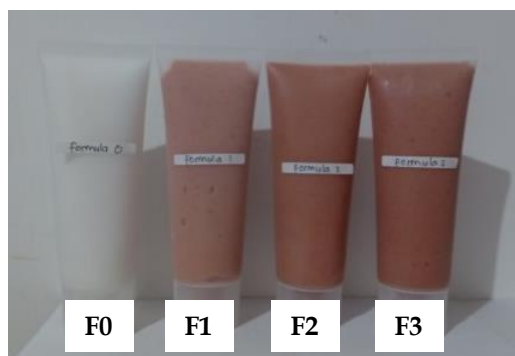
Fig. 2. Formula body lotion ethanol extract of kepunding bark

Homogeneity testing is carried out to see the mixability of the active substance with the carrier material so that it can provide maximum effect after application. The results obtained in the body lotion preparation are all homogeneous formulas.