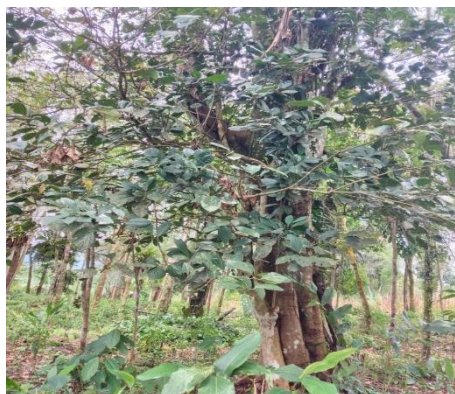
Fig. 1. Kepundung ( Baccaurea macrocarpa ) plant

are popular because of their sweet fruit, and their stems are widely used by the community as building materials for houses (Haegens, 2000).