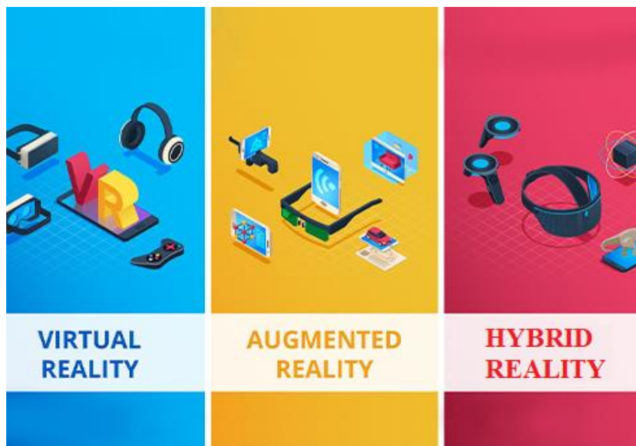
Fig. 1. Virtual, Augmented, and Hybrid reality.