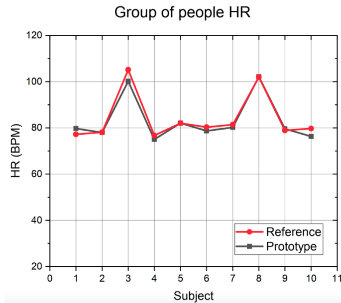
Fig. 5. Comparison HR between the prototype and reference.