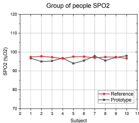
Fig. 4. Comparison SPO2 between the prototype and reference.

Table 1 shows the data average of SPO2 measurements. From the results of measuring the average SPO2 by calculating the Pearson correlation, it is obtained with a value of -0.73, which has a strong accuracy between the value of the prototype device and the conventional pulse oximeter reference device. The calculation is as follow.