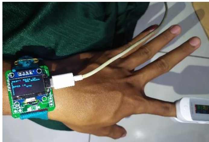
Fig. 3. Installation of a prototype device with a conventional pulse oximeter

The data collection using a compact bracelet pulse oximeter monitoring prototype is shown in Fig. 3. At the time of collecting data, a prototype device is used on the wrist of the subject, and a conventional pulse oximeter is clipped to the fingertip. Conventional pulse oximeter tool (Yobekan, calibrated standard) is used as a reference of SPO2 and HR values. Ten subjects with sampling time intervals every 30 seconds were conducted pulse oximeter measurement. The subjects were children ten years old, adults 20-35 years old to 64 years old. Activities before monitoring each subject in a condition where they finished working from home, finished taking a nap, and studied online at home. Fig. 4 and Fig. 5 show that linear relationships between prototype and reference pulse oximeter.