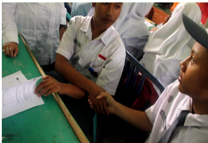
Figure 6. Students Role-played Handshake

Every group conducted the discussion in order to determine the number of people in the two main teams of takraw . After that, students did the handshake scene among players where student A did handshake with student B and so on. Thus, students were asked to determine how often the handshake will occur in the given problem. Figure 6 is a figure of students doing the role-play handshake scene.