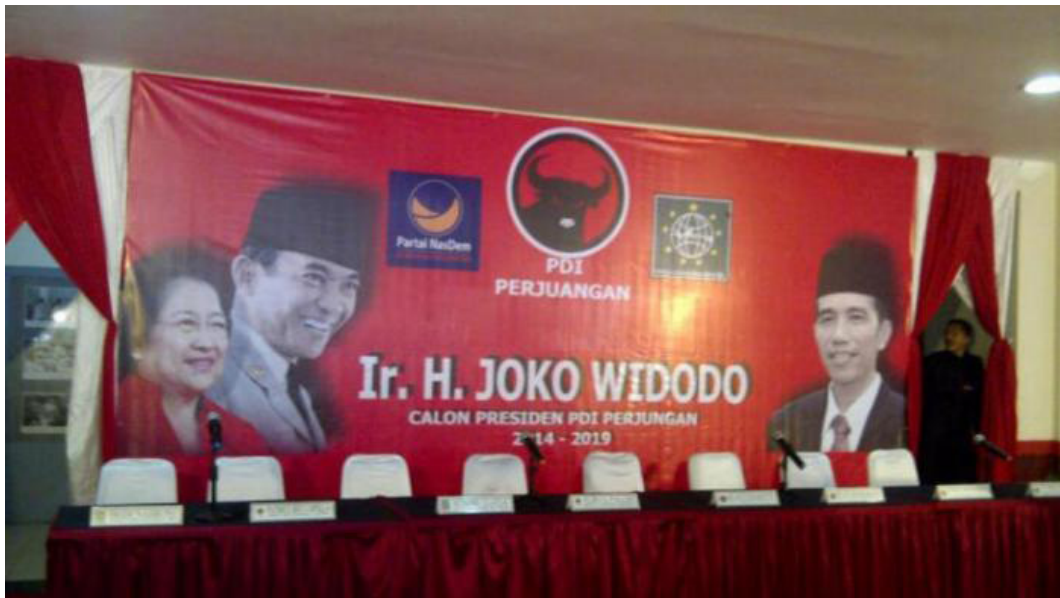
Fig. 7 Indonesia's first President appears on the PDIP banner (Waskita, 2014)

In Indonesia, democracy is on an extended break without a moral message, inviolable! This message feels louder than the political message that has been budgeted through envelopes. But here's the reality, the meme above comes with a classic satire about its emphasis on a democratic position that is not transparent and ambiguous, even dead. The above memes are a form or type of Name-Calling or creating a specific label on an event or phenomenon or a particular person or situation. Democracy is symbolized by a tomb, meaning that there is currently no social justice in Indonesia. There is justice that dies. Memes as paradoxes are also moral messages about a sense of justice that hurts. Communication provides a particular agenda for interpreting memes as a form or way of exploiting all possibilities to make the silence of the message heard and turned into a convincing fact. Now, we may ask ourselves, does democracy still exist? And if it still exists, is it worth living amid conspiracies and cheap agitation. This stigma is not a stereotype, but it is the fact that democracy is an illusion (Simon, 2007).