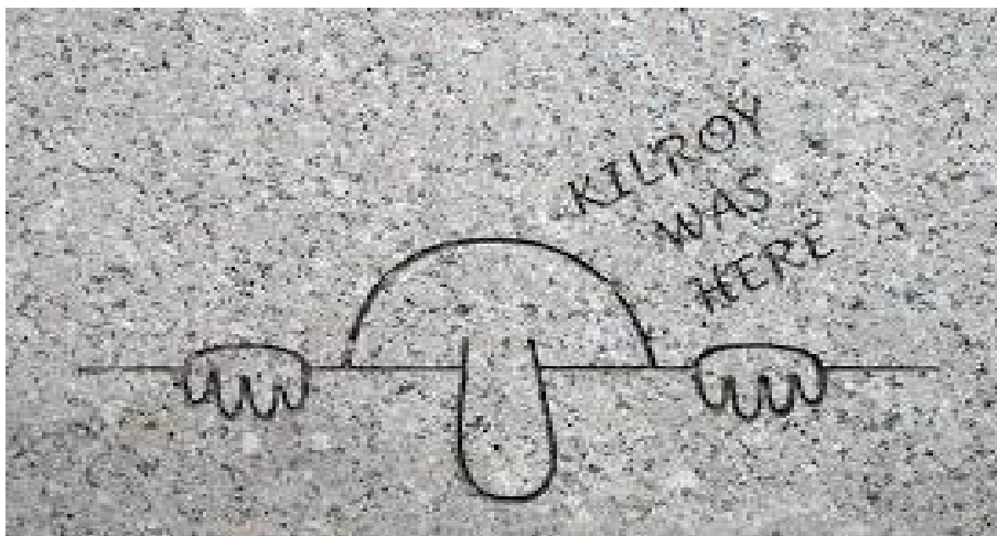
Fig. 2. Kilroy Was Here (Kien, 2019)

Kilroy Was Here was a popular meme during World War II. It is usually seen in graffiti. Its origins are still a mystery to this day, but this meme was the mastermind of the conflict in World War II. In the constellation, media memes increasingly play the role of rational "figures" controlling the political elite. Like Kilroy's Was Here , memes tend to position it as formal representative institutions such as parties and parliaments. Today's political debate is more of a game between professionals who simultaneously deviate from the original purpose of communication. Social media memes are seen as something free without a space barrier. The public will be brought into mysterious matters. However, the existence of memes like Kilroy can be questioned as to the initial conjecture of political conflict.