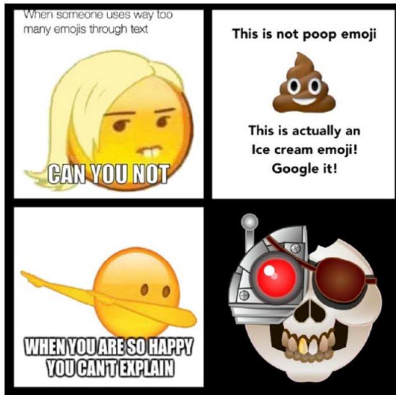
Fig. 3 Emoji Discourse (Kien, 2019)

morality because the violence on social media does not touch us directly but touches our cognition. In this book, Kien has tried to restore the spirit of communication to promote a form of emotional realism that allows ordinary citizens to escape their political passivity and even indifference to react adequately and competently to whatever their political representatives provide (Pruss, 2018)