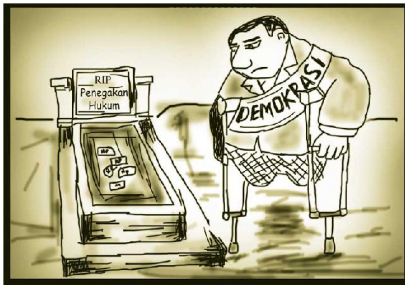
Fig. 6 Meme depicts Indonesian democracy (RiauMandiri.co, 2015)