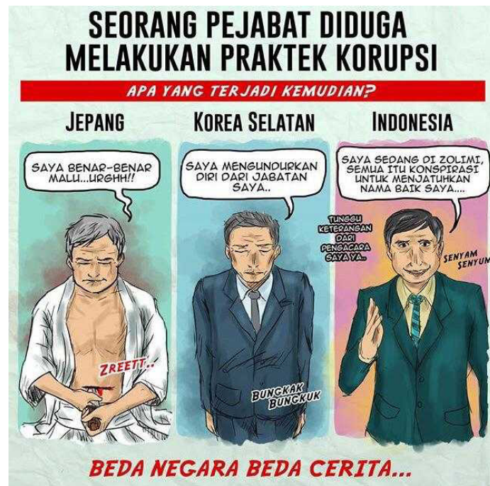
Fig. 5 Meme about the comparison between Japan, Korea, and Indonesia's political elite (Anzulai, 2018)