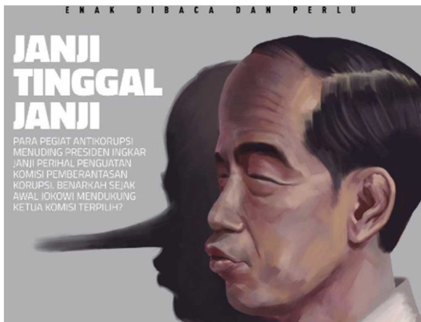
Fig. 4 Jokowi Pinokio on Tempo magazine’s cover (CNN Indonesia, 2019).

According to Emoji Discourse above, the top left refers to the popular “Can You Not” image macro, while the top right exemplifies watching emoji discourse. The lower left emoji depicts the “Dabbing” dance meme, while the right shows a pop culture Cyborg reference (Unicode.org, n.d).