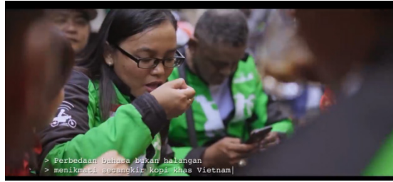
Fig 7. Gojek Drivers Enjoying Vietnamese Coffee

Vietnamese coffee is one of the famous drinks in Vietnam. Drivers are invited to enjoy Vietnamese coffee on the roadside. From 03:07 to 03:15, Gojek partners seemed to be enjoying coffee while laughing and chatting with Goviet drivers. It was said in the subtitle of the snippet that “Difference is not an obstacle” despite different cultures and languages, the two Gojek partners can get along with one another.