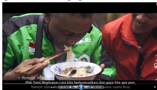
Fig 12. Enjoying Vietnamese Meat Balls

The spirit of learning the Vietnamese language shows the emergence of empathy for Vietnamese culture. After going through various cultural experiences in Vietnam, the drivers become familiar and want to further integrate themselves with Vietnamese culture by learning the Vietnamese language so that it would be easier to understand one another.