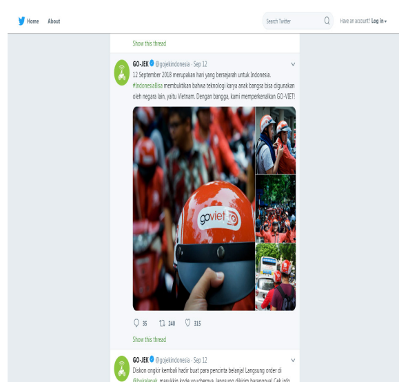
Fig 2 Gojek Tweets Regarding Their New Brand Goviet