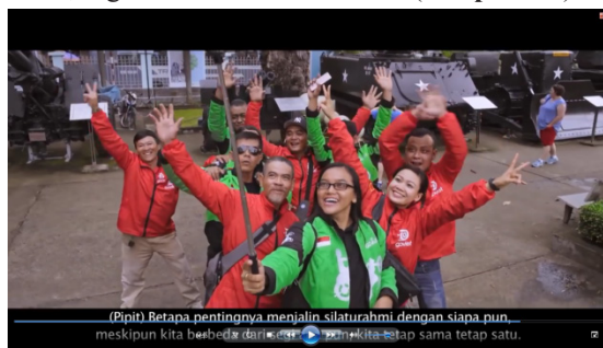
Fig 15. Capturing the Moments between Gojek and Goviet Drives

It showed the adaptation within the Gojek drivers who remain steadfast in their values and religion and respect the Goviet drivers' religion. Further showed that Gojek drivers are interested and appreciate the culture and religion in Vietnam, but they still stick to their values. The sequences from 04:34 to 04:40 showed a group photo activity filled with laughter from Gojek and Goviet drivers in the Ho Chi Minh City Hall area. Expressions of joy and embracing each other show kinship, intimacy, and acceptance, regardless of all differences ( Adaptation ).