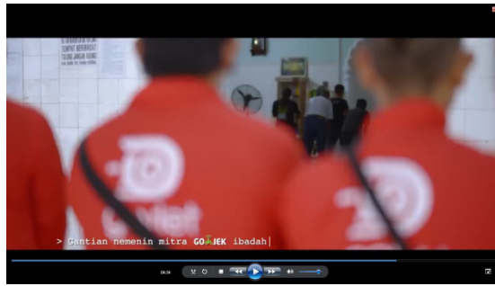
Fig 14..Goviet Drivers Accompanied Gojek Drivers to the mosque

It showed the adaptation within the Gojek drivers who remain steadfast in their values and religion and respect the Goviet drivers' religion. Further showed that Gojek drivers are interested and appreciate the culture and religion in Vietnam, but they still stick to their values. The sequences from 04:34 to 04:40 showed a group photo activity filled with laughter from Gojek and Goviet drivers in the Ho Chi Minh City Hall area. Expressions of joy and embracing each other show kinship, intimacy, and acceptance, regardless of all differences ( Adaptation ).