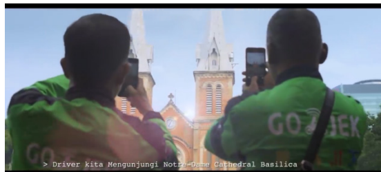
Fig 6. Sightseeing to Notre-Dame Cathedral Basilica

Similar to the first minute of the climax scene, at 02:49 to 03:01, the minimization still radiates on Gojek drivers. Together with the Goviet drivers, Gojek drivers went sightseeing around Ho Chi Minh City. It shows the effort taken from Goviet drivers to make GO-JEK drivers familiar with their city and culture.