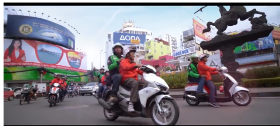
Fig 5. Gojek Drivers Ride Sharing with Goviet Drivers

On the 02:31 to 02:48 minutes, the intercultural sensitivity stage found in the sequences was the minimization stage, where Gojek drivers began to reduce their anxiety and negative feelings about different cultures. The moment they met Goviet drivers, they found similarities between them and the Goviet driver.