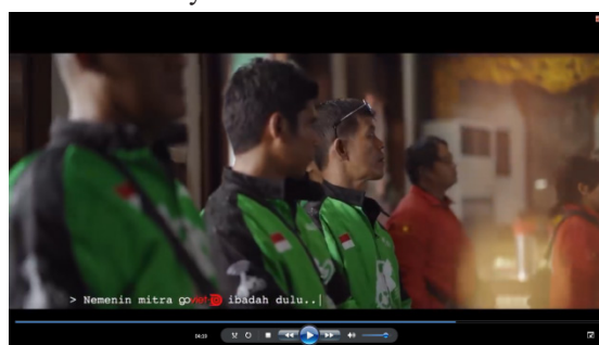
Fig 13. Gojek Drivers Accompanied Goviet Drivers to The Shrine

03:45 to 04:03 indicate the interactions between drivers while enjoying Vietnamese meatballs. Gojek drivers have started to adapt and are more confident in communicating with Goviet drivers. They also have started to enjoy Vietnamese culture. Politely ate Vietnamese food and endlessly tried to learn their culture.