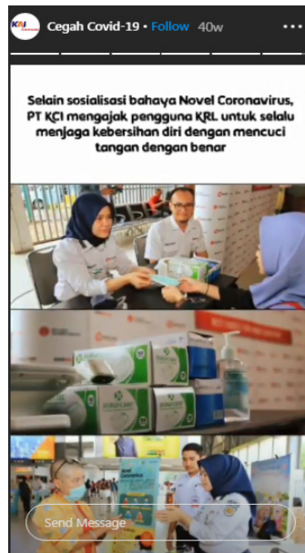
Fig. 4 Instagram story about education on washing hands using soap and distributing masks