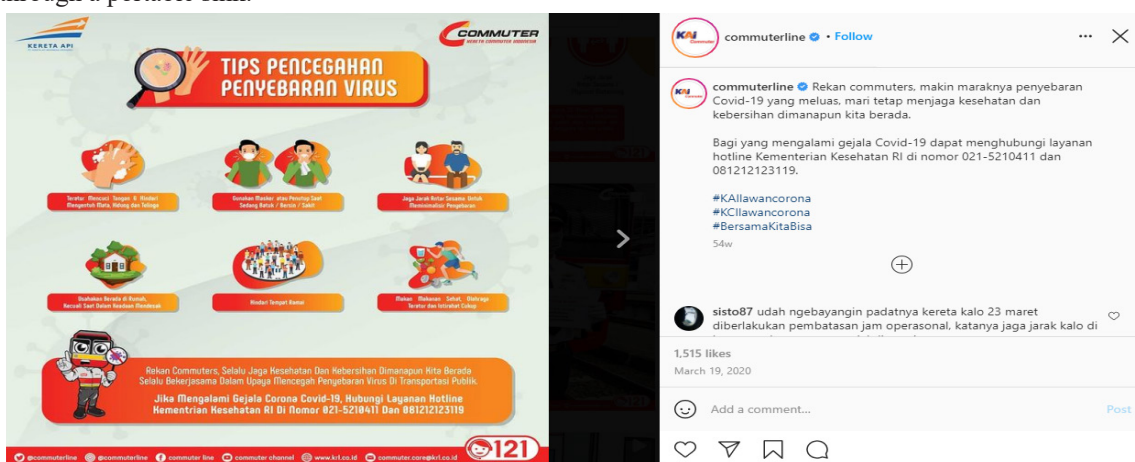
Fig. 1 Tips for Preventing the Spread of Viruses

PT Kereta Commuter Indonesia also conducts socialization to anticipate the Covid-19's spread by uploading @commuterline Instagram account with the hashtag #KCIlawanCorona in the form of posts, stories, and also IG TV to provide education, information and conduct socialization campaigns to anticipate the spread of the Covid-19. There is information regarding the mandatory rules for wearing masks through the Instagram post when in the station area according to the regulations made by the Governor of DKI Jakarta No. 9 of 2020. Signs with a distance of 1 meter at each point in the station area and inside train cars. Additionally, the maximum number of passengers in a train series is limited to 60. Information regarding the adjustment of Commuter Line operating hours has been determined since the enactment of the PSBB on April 10, 2020 (Fitriani, 2020). They are also aggressively conducting campaigns regarding the anticipation of the spread of the Covid-19. They also prioritized passengers to wash their hands with soap and running water through a portable sink.