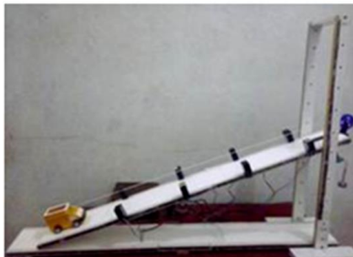
Figure 4. Examples of Newton's Law teaching aids that have been developed Rochaeni et al. (2015)

A teaching aid used in learning should meet several requirements and criteria. According to Sundayana (2014), several props requirements include a). Durable; b). The shape and colour are attractive; c). Simple and easy to operate; d). The size is practical; e). Can present concepts in actual form, pictures, or diagrams; f). Can clarify concepts and not vice versa; g). Become the basis for the growth of abstract thinking concepts for students, and g). They were making students learn to be active and independent.