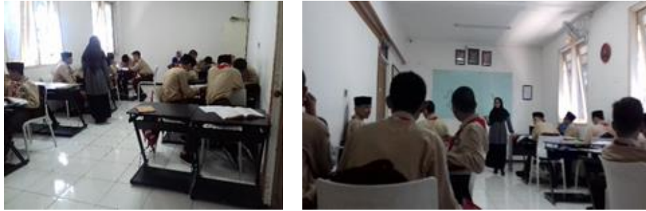
Figure 1. Learning process on Newton's law material

explanation of the teacher's conclusions and assignments for the next meeting. Two elements that are very important in a teaching and learning process are teaching methods and learning aids (Sudarwanto & Hadi, 2014). When learning in class, the teacher always plays an essential role in learning. Students are not challenged to learn independently (student-centred). The current learning strategy prioritises several things, including student activities, laboratory activities, field experiences, case studies, problem-solving, discussions, and simulations (Wibowo & Suhandi, 2013). Several published studies have revealed that a student-centred approach is more effective in increasing student interest and mastery of concepts (Saregar, 2016).