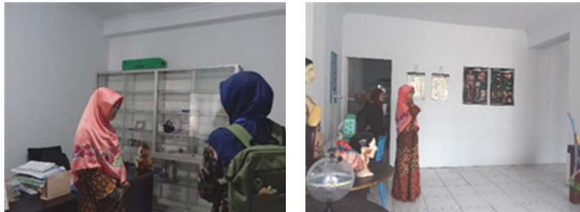
Figure 3. Laboratory conditions

Teachers who are not competent in using physics teaching materials, students who are not active in class, and lack laboratory equipment have low academic achievement and student interest (Aina, 2013). This is evident from most student learning results on newton law material that do not meet the KKM.