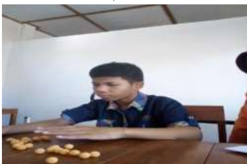
Figure 1. Baseline process phase

The baseline test results showed that students tended to be anxious in doing this baseline test and seemed confused about some of the questions asked, but the students still worked on the readout questions. Students also seem to occasionally ask researchers about abacus media that are still common to students related to calculating addition operations. Based on the analysis of student work results, the student's error lies in counting, which is still confused between doubting or not remembering the amount that has been calculated, so sometimes it must be provoked first. Several question commands must be subtracted, but the question commands are added, and vice versa.