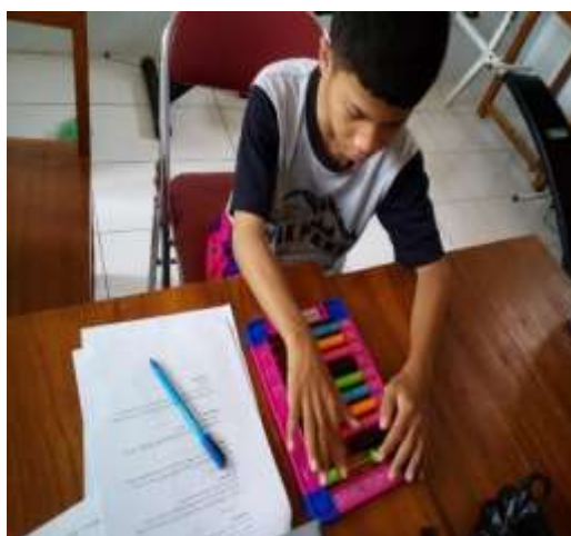
Figure 2. The first intervention phase process

In the next intervention, students were again enthusiastic about participating in the lesson and diligently listening to the researchers' explanations. Students seem to enjoy the intervention process and can carry out the researchers' orders correctly. Students begin to get used to and begin to understand the addition and subtraction operations of 2 numbers. Students actively answer questions and have started independently to operate addition and subtraction numbers well.