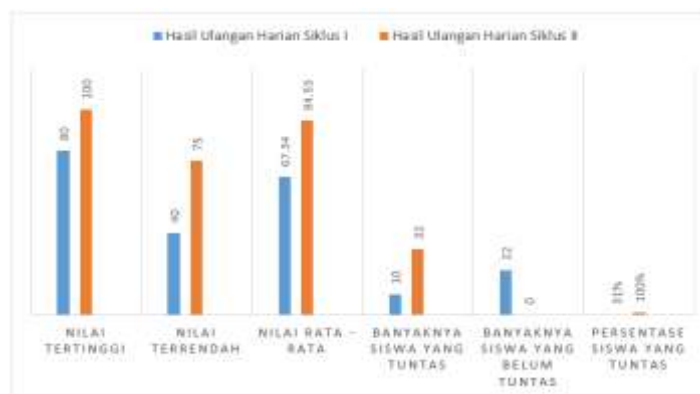
Figure 2. Graph of Percentage of Daily Test Results in the first cycle and second cycle.