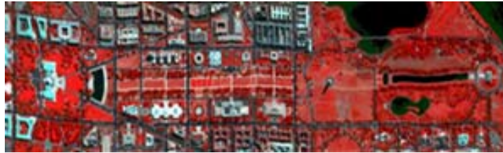
Figure 1. False color images of HYDICE

Classification experiments on hyperspectral data with RVM, PCA+RVM, NMF+RVM and KPCA+RVM (Gauss kernel, width coefficient is 0.5) respectively, compared with the WKNMF+RVM method proposed in this paper. The Overall Accuracy (OA) used as evaluation stand in the experiment results. Experiment randomly select 1%, 3% and 5% samples respectively as training data sets on original hyperspectral data and other samples as test data sets. The classification experiments were repeated 10 times, taking the statistical average for final results. The RVM kernel functions are used RBF (Radial Basis Function) kernel function, the width coefficient of 0.5.