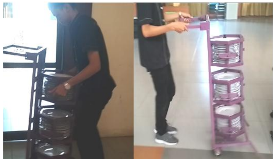
Figure 5. Posture of the employee's body after using the Plate Lifting Tool