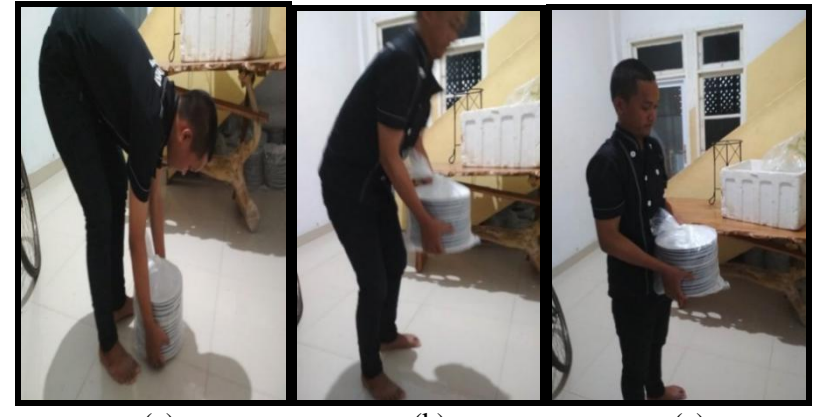
(a) (b) (c) Figure 1. Manual Handling of Plate Lifting Process

Based on Figure 1, it can be seen that the employee is lifting the plate where the position of the body is bent with the hand supporting the plate. Figure 1 (b) can be seen the process of changing position from bending to upright position, and bending hand position by lifting plate loads. Figure 1 (c) can be seen after the lifting process and employees are lifting plates to go to the transport car, where the position of the hand bent with a heavy load. This appointment is done manually, repeatedly and is less ergonomic.