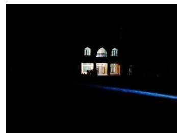
Figure 4. Mosque

PN informed, through Figure 4, that he needed to worship Allah. this sincere