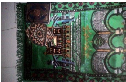
Figure 3. Religion

This image represents them apart from having to carry out their daily activities, and being preoccupied with their many assignments and also not forgetting to always worship Allah SWT. Because of all the sadness, fatigue and also fatigue after doing the business of the day, just by worshiping will get calm and also peace. In fact, sometimes the answers to all the difficulties of our life will be found by doing worship. Like the comments they have put forward.