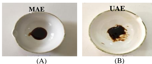
Figure 1. Papaya Seed Ethanol Extract Results MAE (A) and UAE (B)