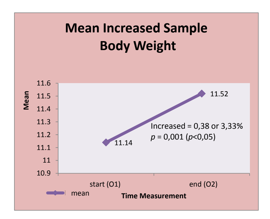
Figure 1. Mean Increase Weight Loss

Furthermore, to determine the level of significance changes in pattern of parenting practices between mothers before and after nutritional assistance can be seen in Table 6 below: