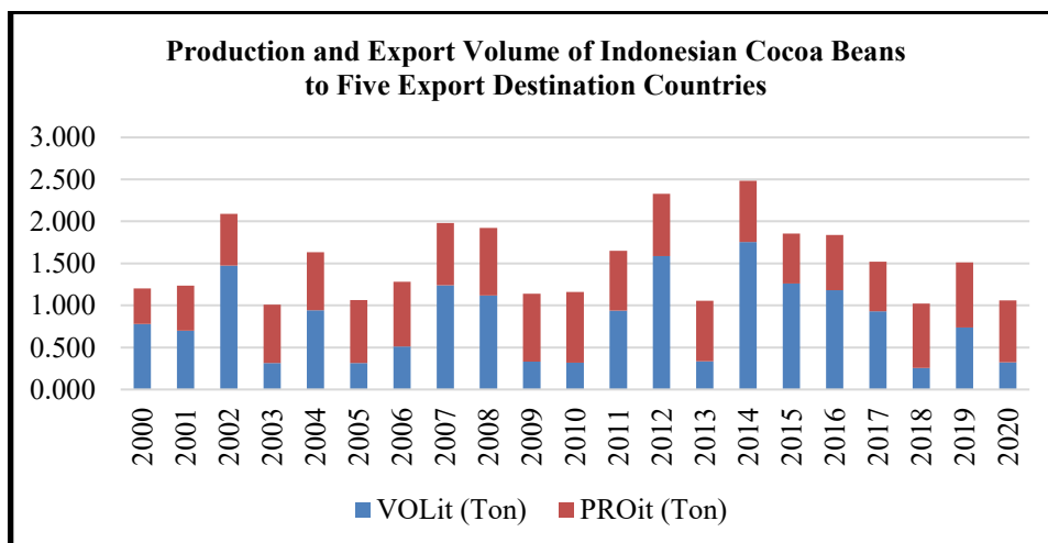
Fig. 2. Graph of Production and Export Volume of Indonesian Cocoa Beans to Five Export Destinations

The development of production and export volume of Indonesian cocoa beans to export destination countries from 2000 to 2020 tends to fluctuate. Production and export volume play an important role in export growth. Although an increase in production will not necessarily be followed by an increase in exports, if production is accompanied by quality, it is possible that export volumes will increase. Graph of production and export volume of Indonesian cocoa beans to five export destinations show in Fig. 2.