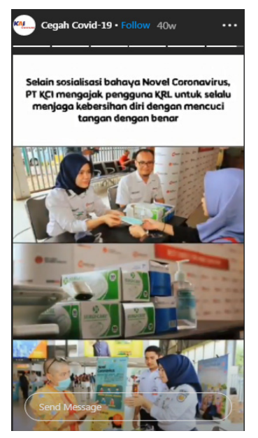
Fig. 4 Instagram story about education on washing hands using soap and distributing masks