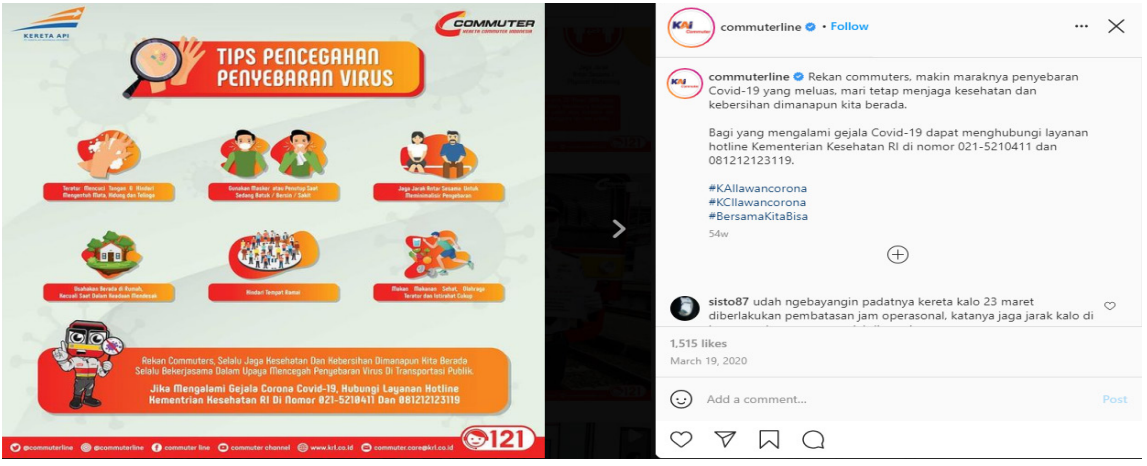
Fig. 1 Tips for Preventing the Spread of Viruses

PT Kereta Commuter Indonesia also conducts socialization to anticipate the Covid-19's spread by uploading @ commuterline Instagram account with the hashtag #KCILawanCorona in the form of posts, stories, and also IG TV to provide education, information and conduct socialization campaigns to anticipate the spread of the Covid-19. There is information regarding the mandatory rules for wearing masks through the Instagram post when in the station area according to the regulations made by the Governor of DKI Jakarta No. 9 of 2020. Signs with a distance of 1 meter at each point in the station area and inside train cars. Additionally, the maximum number of passengers in a train series is limited to 60. Information regarding the adjustment of Commuter Line operating hours has been determined since the enactment of the PSBB on April 10, 2020 (Fitriani, 2020). They are also aggressively conducting campaigns regarding the anticipation of the spread of the Covid-19. They also prioritized passengers to wash their hands with soap and running water through a portable sink.