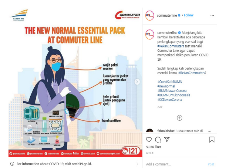
Fig. 2 Posts about socializing anticipation of the spread of the Covid-19

Content on @commuterline Instagram account regarding the socialization of anticipating the Covid-19 spread in the form of Instagram stories, Instagram TV, and posts.