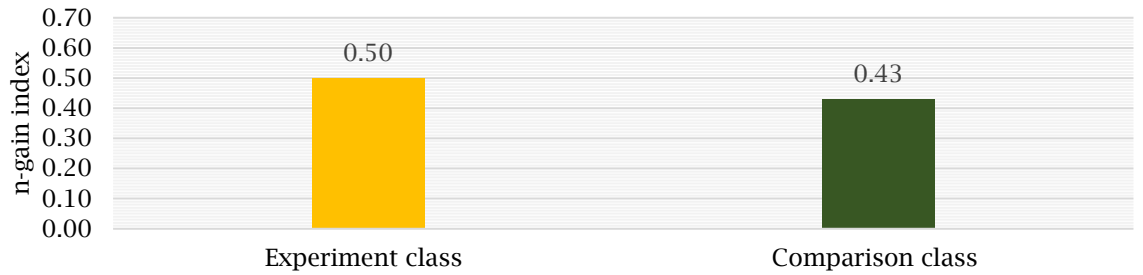
Figure 2. Comparison of n-gain index of problem-solving skills

The research results by Adisendjaja et al. (2019) also revealed similar findings: students' problem-solving skills after participating in field trip learning on ecosystem materials showed a significant improvement. This result is because during field trips, students "have a detailed description of the problem" because they encounter the object or phenomenon firsthand and know how to solve it. Students are more than observing existing objects or phenomena; they also research them. In fact, through direct observation of phenomena, students' reasoning skills are indirectly involved. It can also be assumed that direct observation of the problem in nature during a field trip allows one to see a more concise description of the problem.