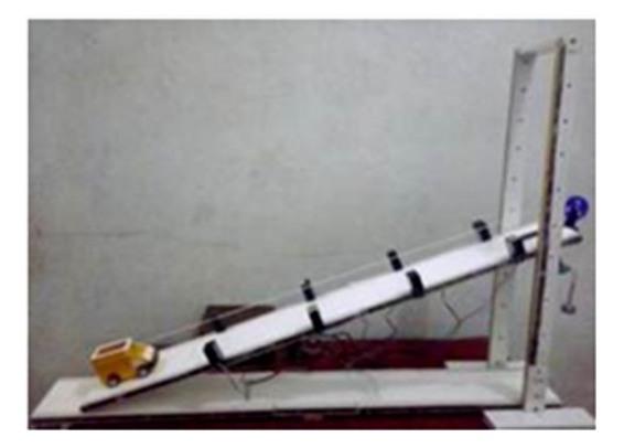
Figure 4. Examples of Newton's Law teaching aids that have been developed Rochaeni et al. (2015)

A teaching aid used in learning should meet several requirements and criteria. According to Sundayana (2014), several props requirements include a). Durable; b). The shape and colour are attractive; c). Simple and easy to operate; d). The size is practical; e). Can present concepts in actual form, pictures, or diagrams; f). Can clarify concepts and not vice versa; g). Become the basis for the growth of abstract thinking concepts for students, and g). They were making students learn to be active and independent.