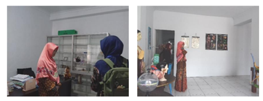
Figure 3. Laboratory conditions

Teachers who are not competent in using physics teaching materials, students who are not active in class, and lack laboratory equipment have low academic achievement and student interest (Aina, 2013). This is evident from most student learning results on newton law material that do not meet the KKM.