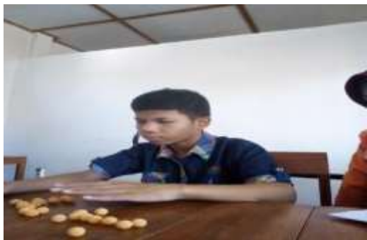
Figure 1. Baseline process phase

The baseline test results showed that students tended to be anxious in doing this baseline test and seemed confused about some of the questions asked, but the students still worked on the readout questions. Students also seem to occasionally ask researchers about abacus media that are still common to students related to calculating addition operations. Based on the analysis of student work results, the student's error lies in counting, which is still confused between doubting or not remembering the amount that has been calculated, so sometimes it must be provoked first. Several question commands must be subtracted, but the question commands are added, and vice versa.