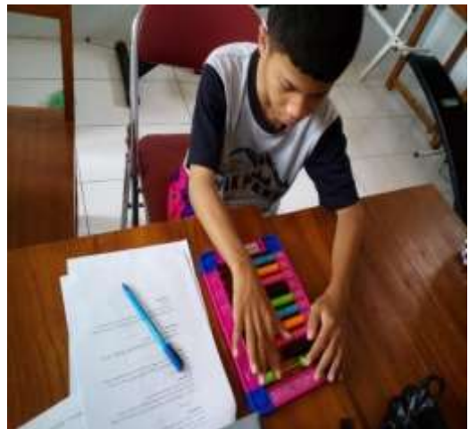
Figure 2. The first intervention phase process

In the next intervention, students were again enthusiastic about participating in the lesson and diligently listening to the researchers' explanations. Students seem to enjoy the intervention process and can carry out the researchers' orders correctly. Students begin to get used to and begin to understand the addition and subtraction operations of 2 numbers. Students actively answer questions and have started independently to operate addition and subtraction numbers well.