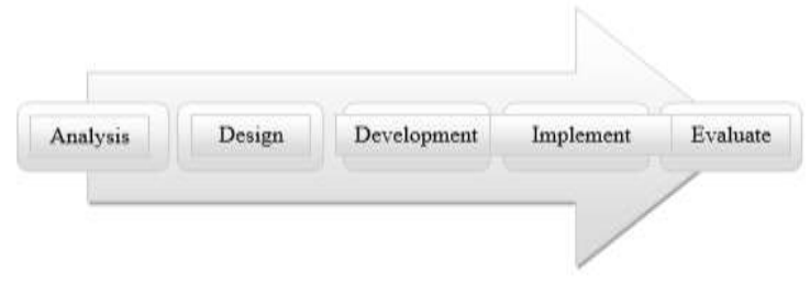
Figure I. Flowchart of ADDIE Development Method

This research is research and development (Research and Development). Development research is a research method to develop a new product or improve existing products and can be justified. This research focuses on developing electronic modules packaged in the form of Compact Disc (CD). Researchers use one of the development models to produce the right product, namely ADDIE (Analysis, Design, Development, Implementation, Evaluation). In detail, the ADDIE development method can be described by Figure 1.