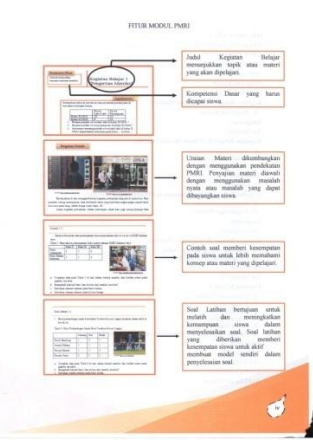
Figure 2. Content of the book