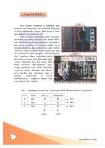
Figure 3. Content of the book